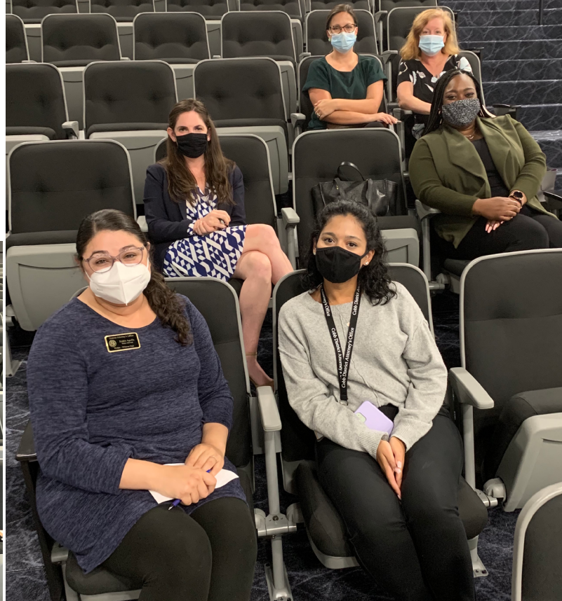
Cobb County Study Tour Report