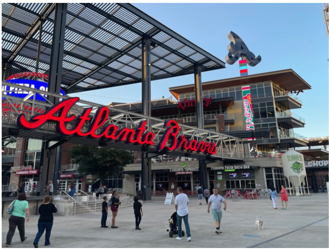
Cobb County Study Tour Report

need to resend the survey to a broader audience to capture information from those missing from the partner meetings. This small data set does show there is belief partners and staff will gain new knowledge about services and programs and will develop valuable relationships because of the Family Justice Center. The data also revealed drawbacks because of co-locating with the Family Justice Center that include frustration or aggravation and anticipated diversion of time and resources away from other priorities or obligations. It will be very important to revisit this data after more community partners complete the survey to get a clearer picture of what Cobb County really believes.